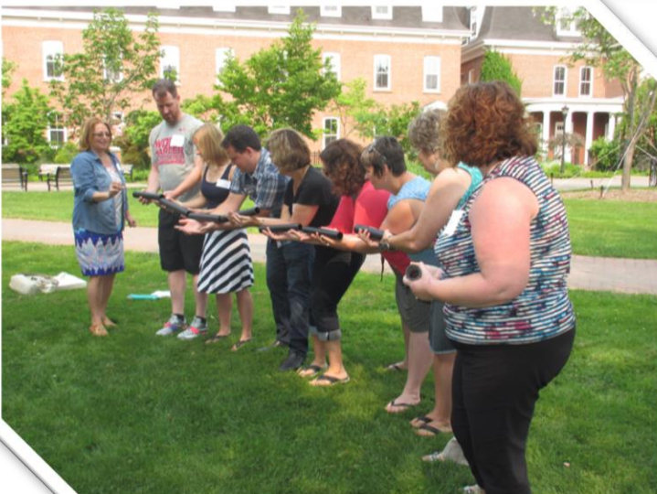
Members of the Mental Health and Wellness cohort #3 participate in a team building activity